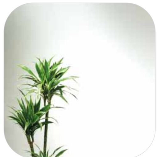
Pilkington Optimirror™ OW