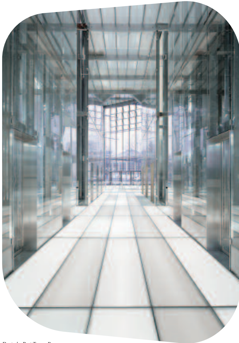
Deutsche Post Tower, Bonn.