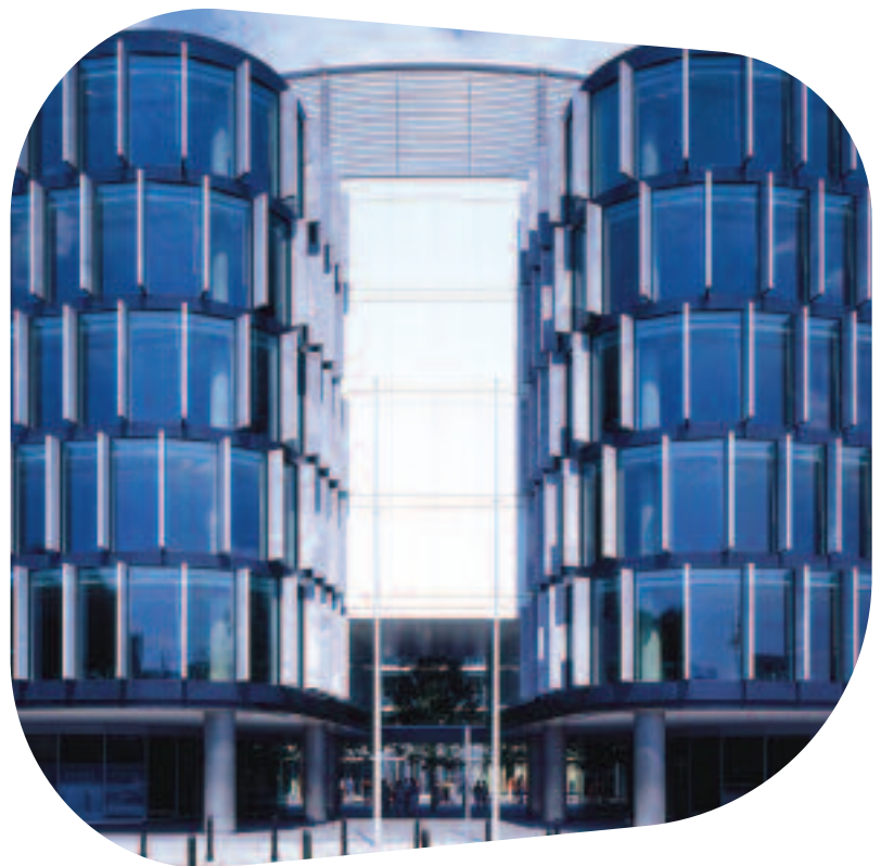
Metropolitan Building, Warsaw